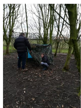
Year 5 Forest School