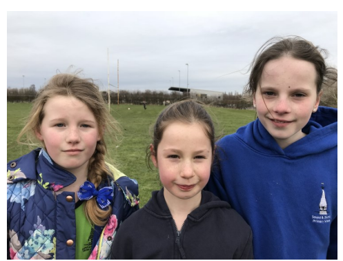
Year 3&4 Spring Production