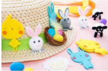
Easter Bonnet Parade