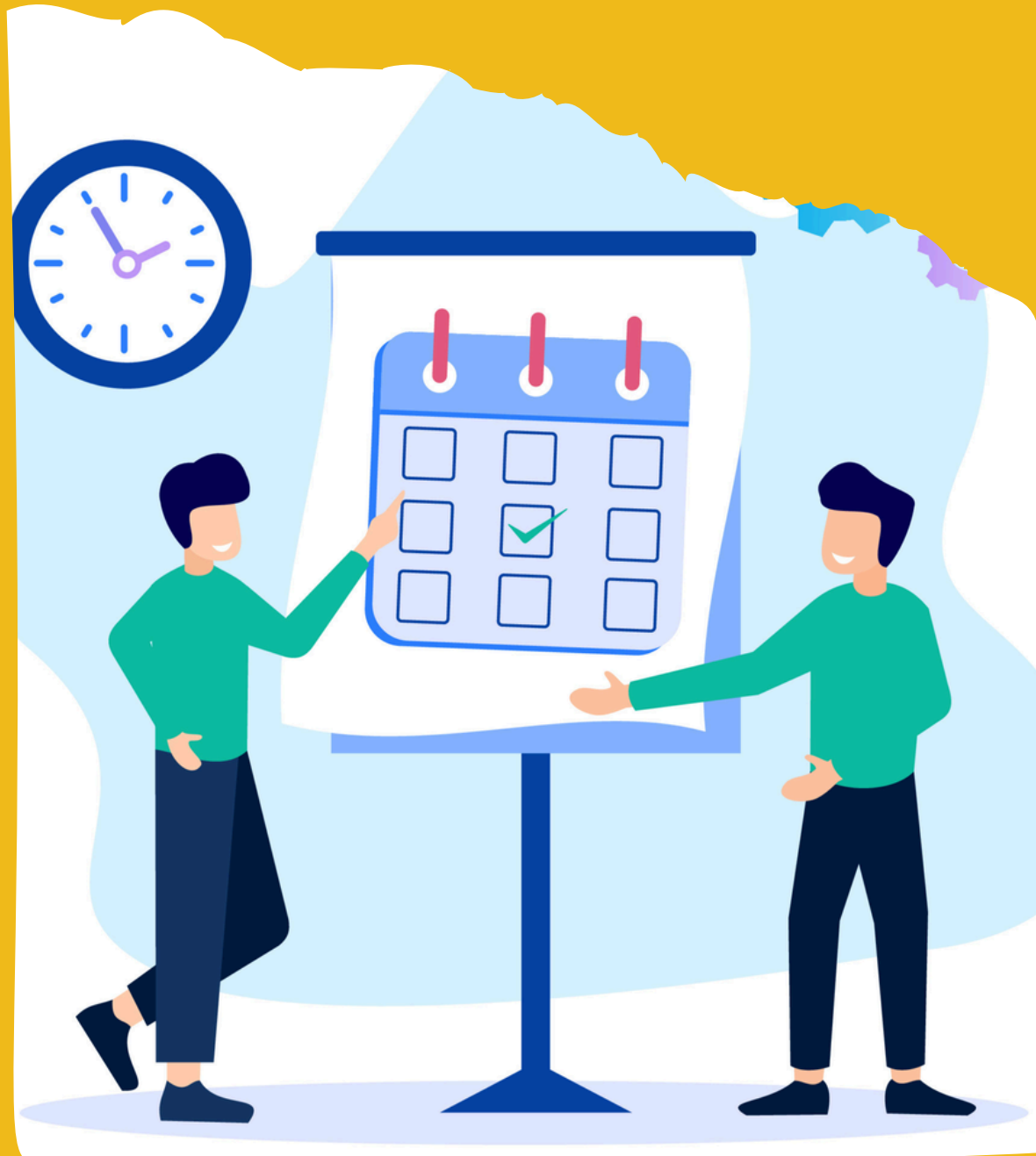
Opal Class Timetable 2024-2025